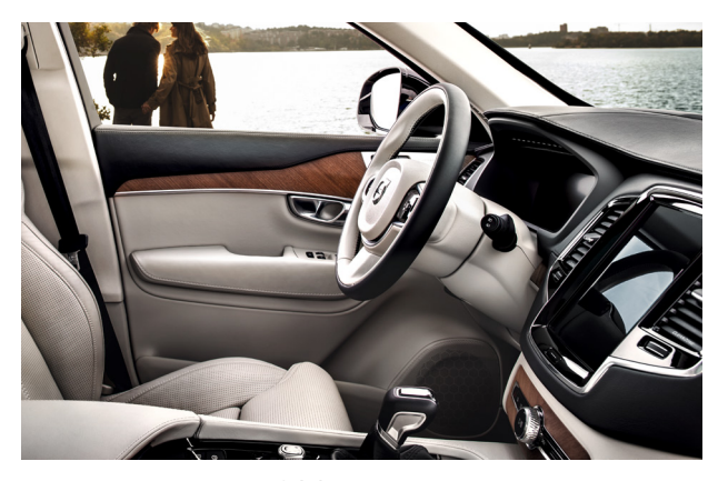
XC90 Inscription Perforated Nappa Leather Blond in Blond Charcoal interior, Linear Walnut decor inlays