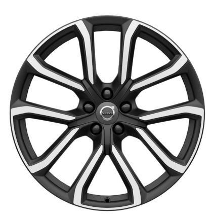
20", 5- Double Spoke, Matt Tech Black/Diamond Cut, (234) Momentum/Inscription