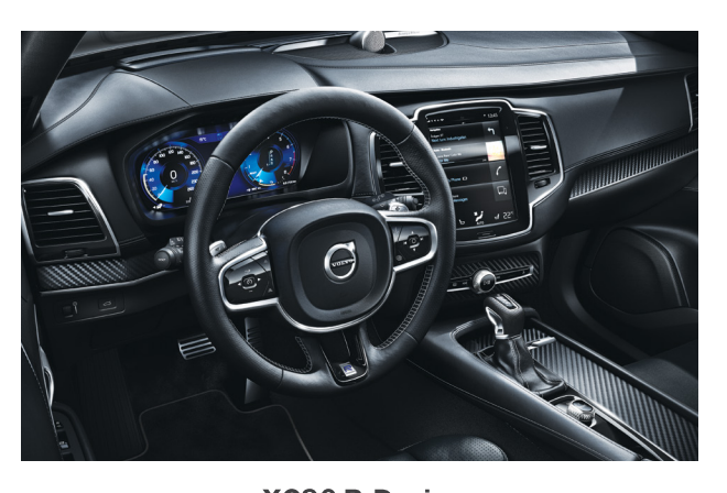
XC90 R-Design Suede Look Nappa Leather Charcoal in Charcoal interior, R-Design Carbon Fibre trim