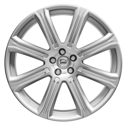
21", 8-Spoke, Silver/Diamond Cut, (174) Inscription