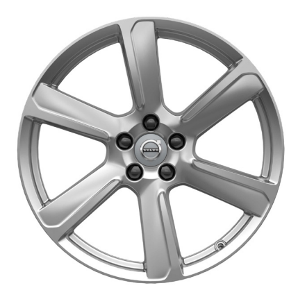
19", 6-Spoke Turbine, Silver, (177) Momentum /Inscription