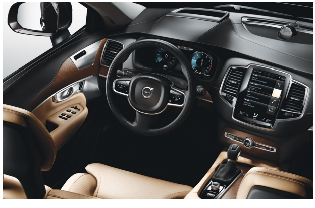
XC90 Inscription Nappa Leather Amber in Charcoal interior, Linear Walnut decor inlays