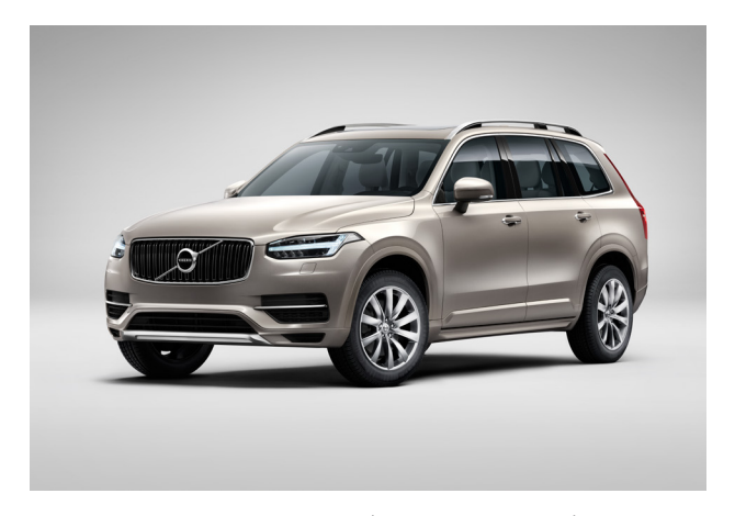
XC90 Momentum (5 Seats / 7 Seats)