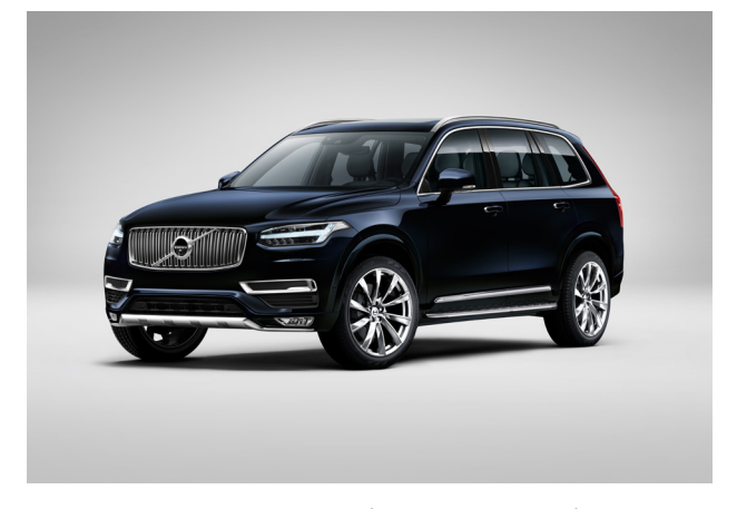
XC90 Inscription (5 Seats / 7 Seats)