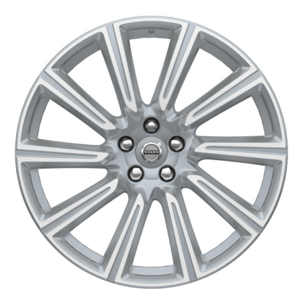
20", 10-Spoke, Silver/Diamond Cut, (173) Inscription