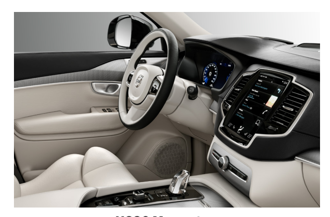
XC90 Momentum Nappa Leather Blond in Blond interior Contour Seat, Metal Mesh trim