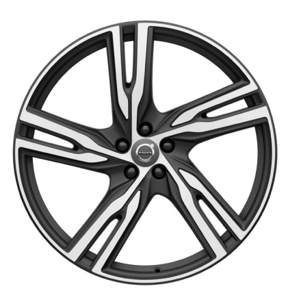
22", 5- Double Spoke, Matt Black/Diamond Cut, (175) Accessory