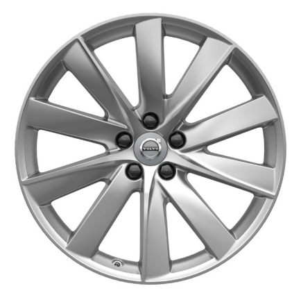
19", 10-Spoke Turbine, Silver, (172) Momentum/Inscription